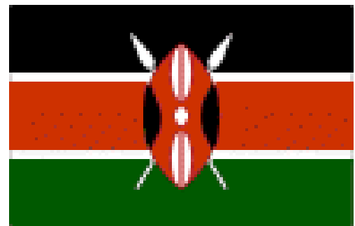
Flag of Kenya