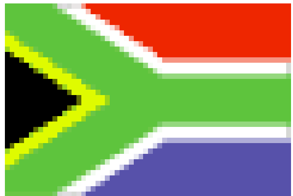
Flag of South Africa