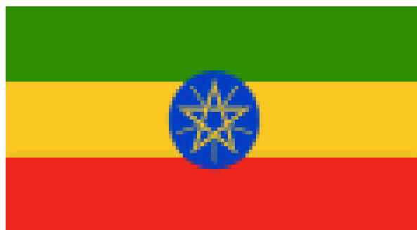
The Flag of Ethiopia